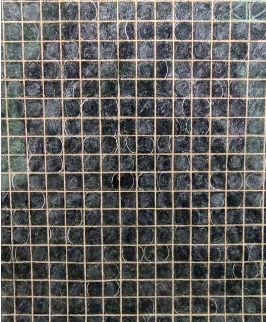
A work from Theresa Chong's Duino Elegies series, 2018-20, copper colored pencil and gouache on Japanese handmade paper.