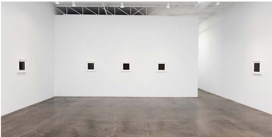
Theresa Chong, Duino Elegies , 2018-20, installation view, 2022, Holly Johnson Gallery, copper colored pencil and gouache on Japanese handmade paper, dimensions variable.